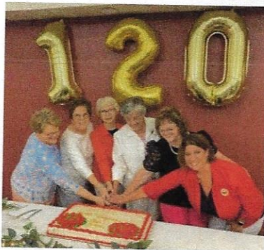
120 th Celebration with cake! And a Women of GFWC History presentation by the GFWC Woman's Club of Bridgeport