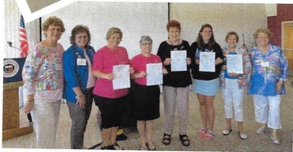
Some of the participants in LEADS Leadership Education and Development Seminar